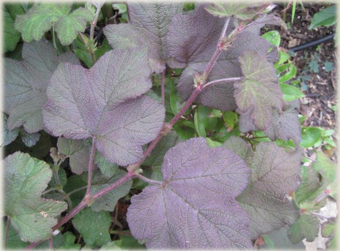
Rubus alceifolius (Form)