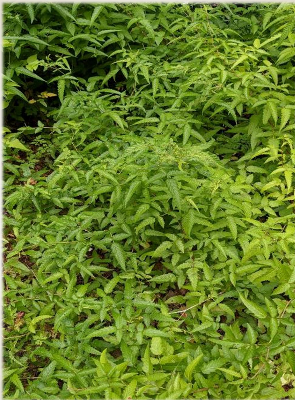
Rubus hybrid- ‘naturally’ occurring