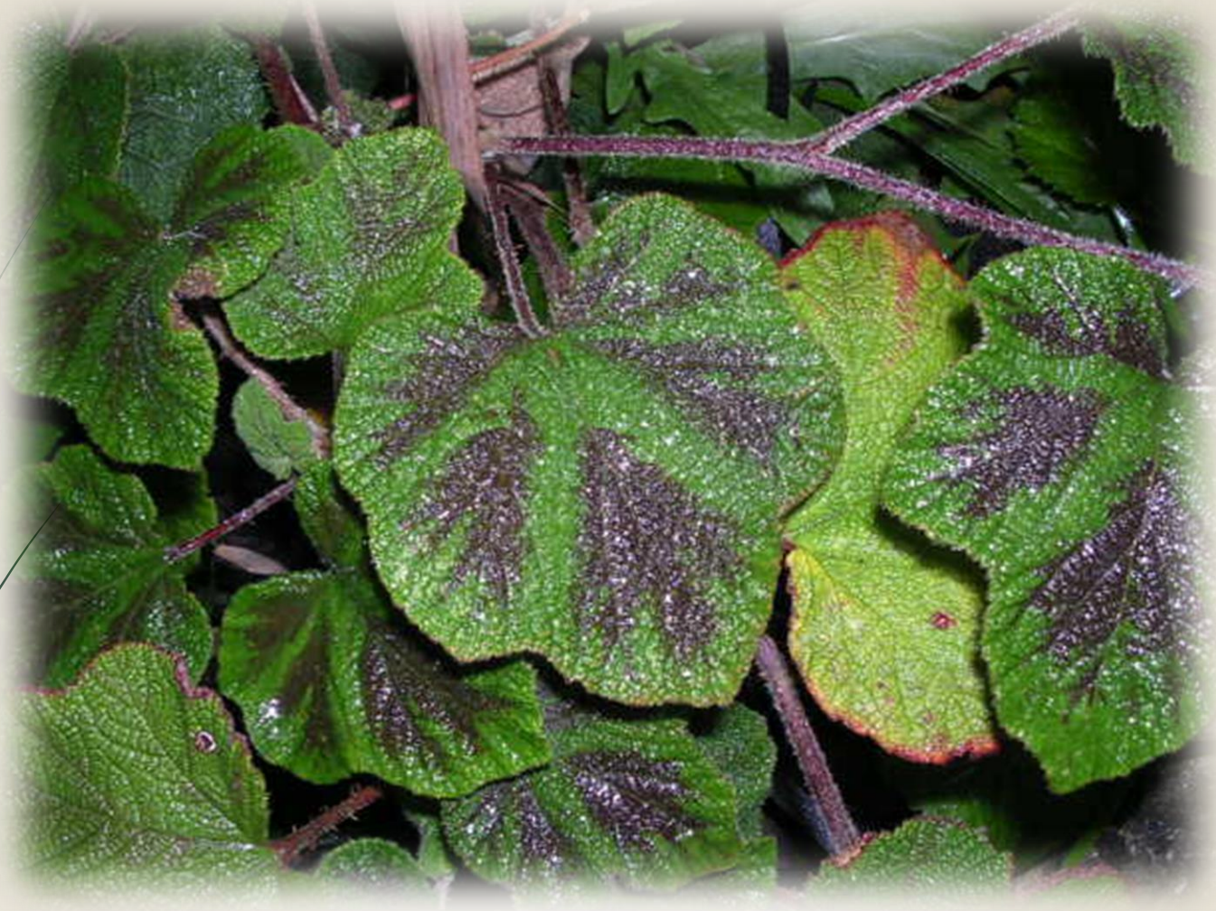
Rubus alceifolius (Form/possible hybrid)