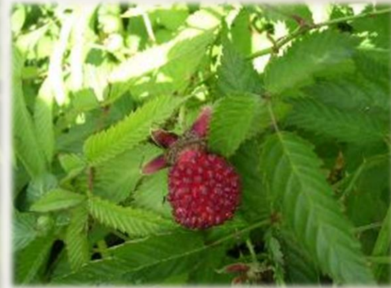
Rubus xanthocarpus x Rubus illecebrosus